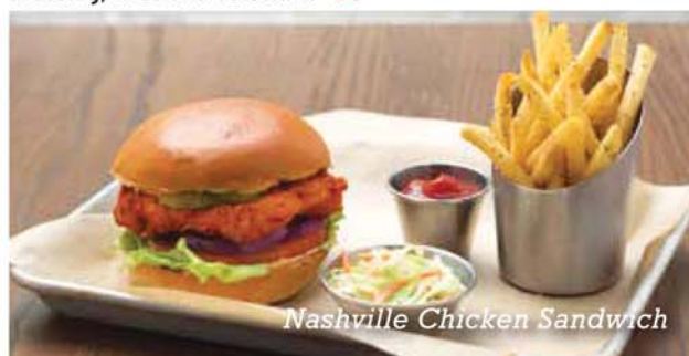
Nashville Chicken Sandwich

Crispy chicken breast tossed in Nashville hot sauce with lettuce, tomato, onion, pickles. Served with bleu cheese dressing, fries and coleslaw. $16