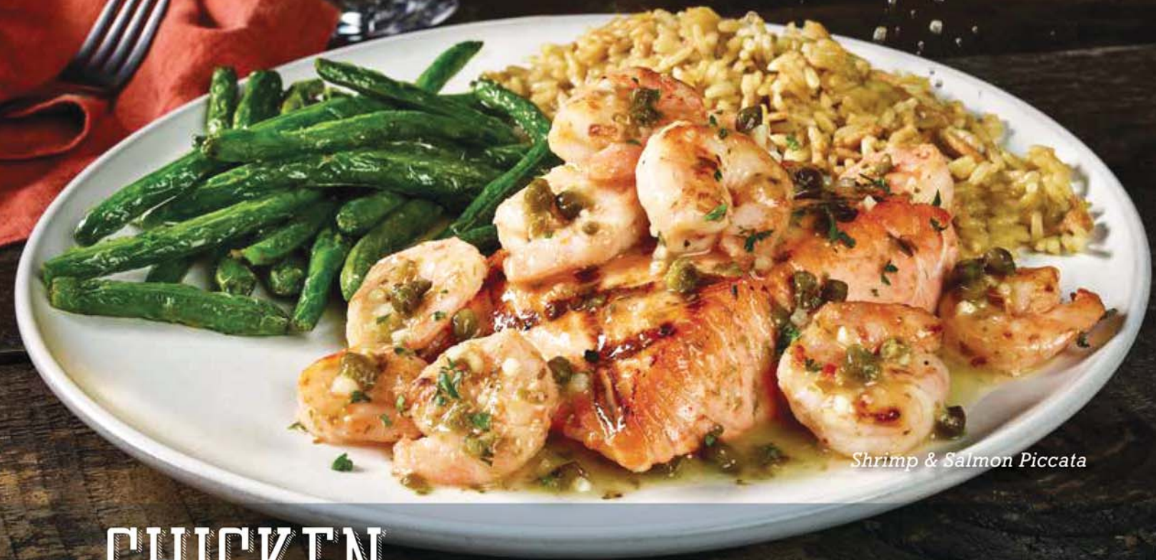
Shrimp & Salmon Piccata