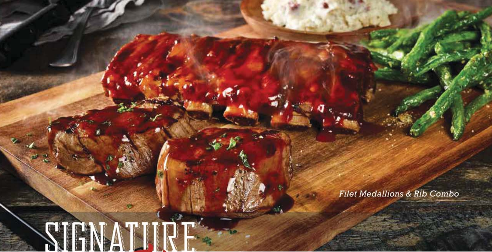
Filet Medallions & Rib Combo