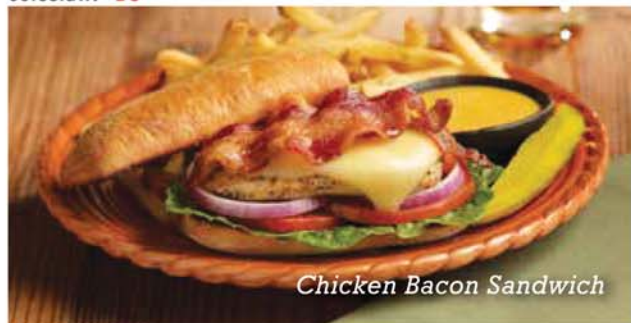
Chicken Bacon Sandwich

Grilled chicken breast, American cheese, bacon, lettuce, tomato, onion, pickles, honey mustard sauce, fries and coleslaw. $16