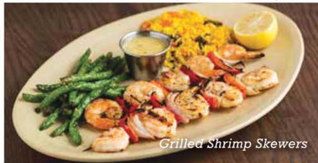
Grilled Shrimp Skewers

Two grilled skewers of shrimp, bell peppers and red onion, basted with scampi butter and Tony's special seasoning. $26