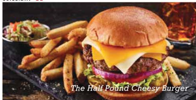
The Half Pound Cheesy Burger

A charbroiled premium beef patty, cheddar and American cheeses, lettuce, tomato, onions, pickles, fries and coleslaw. $17