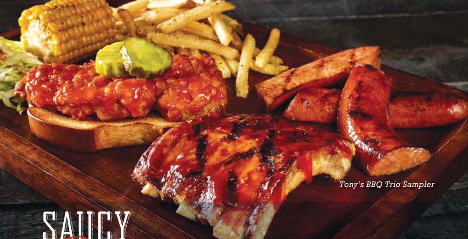
Tony's BBQ Trio Sampler