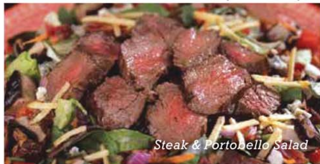
Steak & Portobello Salad

Grilled medallions, portobello mushrooms, romaine, red onions, red bell pepper, potato straws, tomato pesto, bleu cheese crumbles, bacon and red wine balsamic vinaigrette dressing. $22