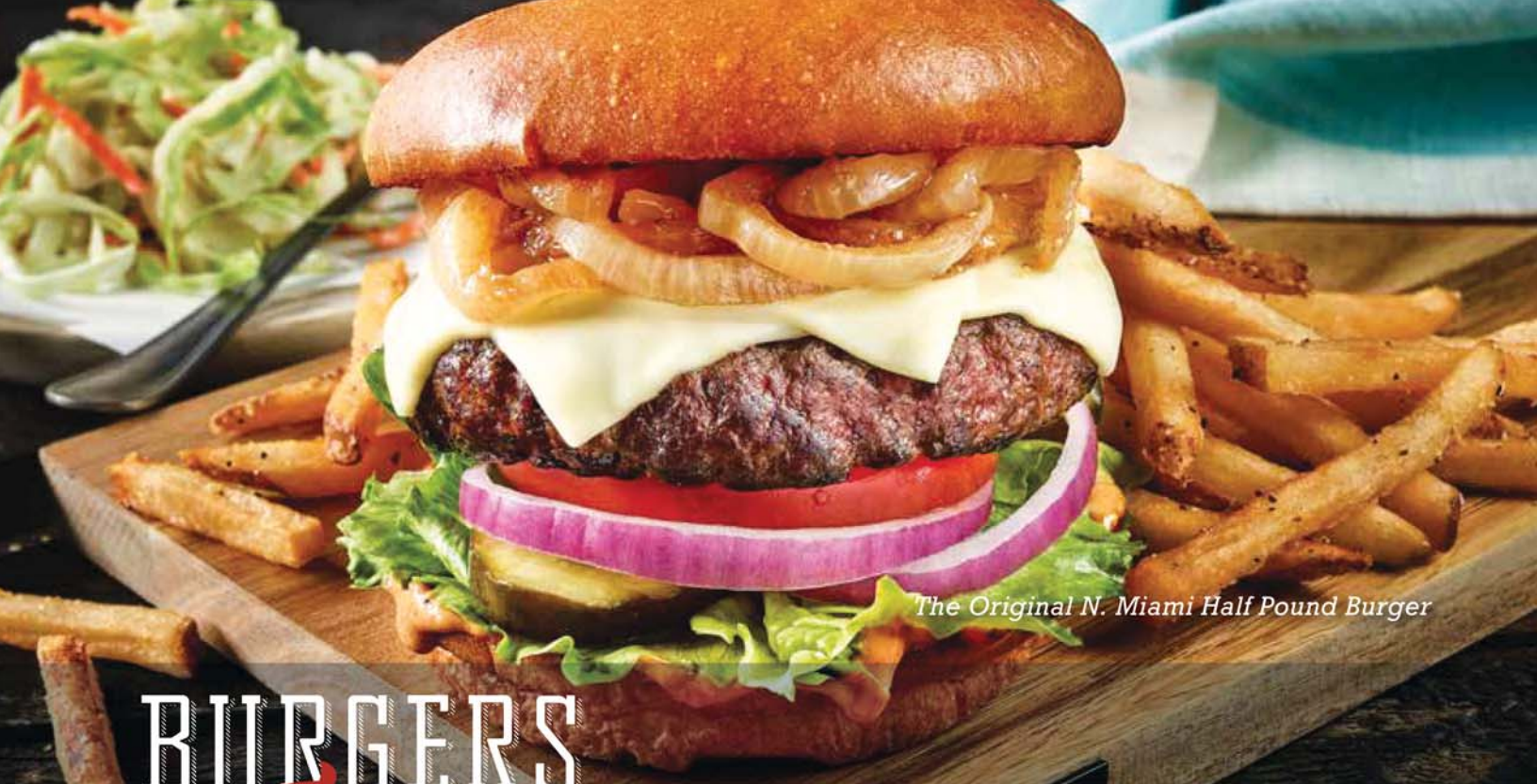
The Original N. Miami Half Pound Burger