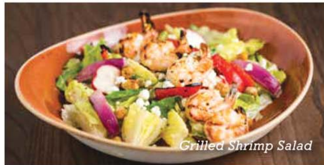
Grilled Shrimp Salad

Romaine, roasted tomatoes, hearts of palm, radishes, crispy chickpeas, grilled onions and peppers, crumbled goat cheese and lemon truffle vinaigrette. $18