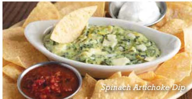
Spinach Artichoke Dip

A creamy blend of spinach, artichoke hearts and Italian cheeses. Served with tortilla chips, salsa and sour cream. $12