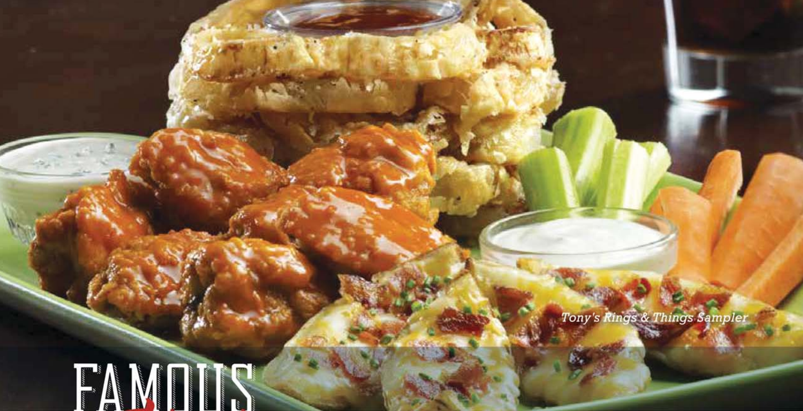
Tony's Rings & Things Sampler