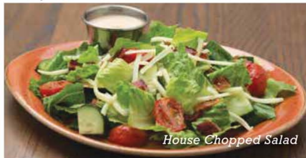
House Chopped Salad

Romaine, bacon, cucumber, roasted tomatoes and white cheddar cheese. Served with house-made BBQ onion ranch dressing. $8