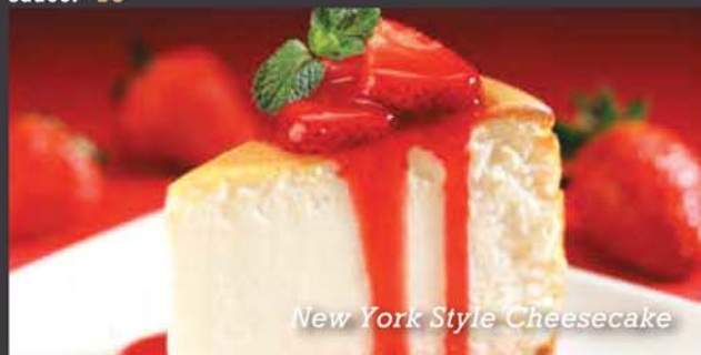
New York Style Cheesecake

Served with your choice of strawberry sauce or chocolate sauce. $10