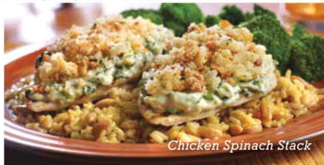
Chicken Spinach Stack

Grilled chicken breasts covered with a blend of four cheeses, artichoke hearts and creamy spinach. Served with rice pilaf and seared garlic green beans. $23