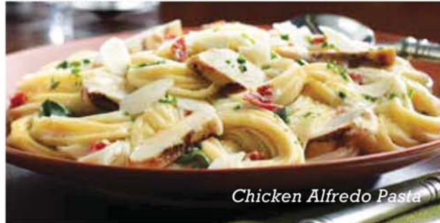
Chicken Alfredo Pasta

Grilled chicken breast, spinach, sundried tomato and linguine tossed in alfredo sauce. $22