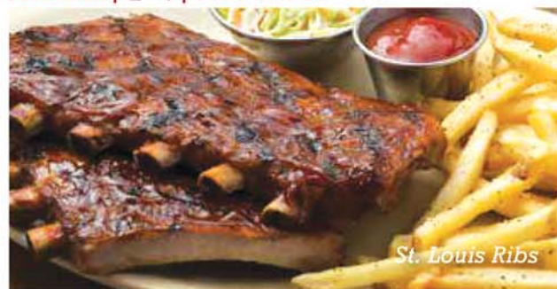
St. Louis Ribs