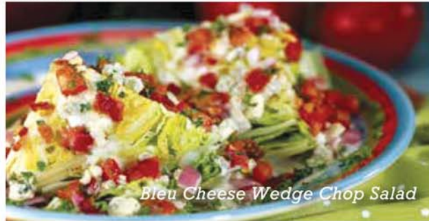
Bleu Cheese Wedge Chop Salad

Chopped iceberg lettuce with red wine vinaigrette, bleu cheese dressing, tomato pesto, bacon, red onions and bleu cheese crumbles. $10