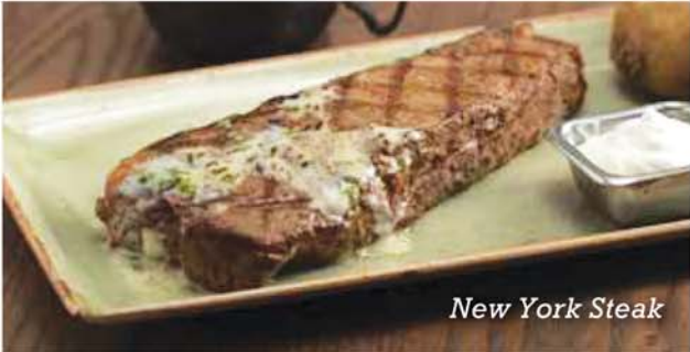
New York Steak

ADD GRILLED SHRIMP | 슈림프 꼬치 추가 | グリルドシュリンプ追加 $11