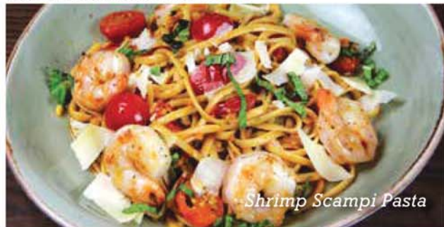
Shrimp Scampi Pasta

Shrimp lightly sauteed with garlic, fresh basil, roasted tomatoes, and a hint of chipotle. Served over linguine and topped with parmesan cheese. $23