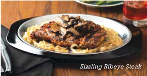
Sizzling Ribeye Steak

ADD GRILLED SHRIMP | 슈림프 꼬치 추가 | グリルドシュリンプ追加 $11