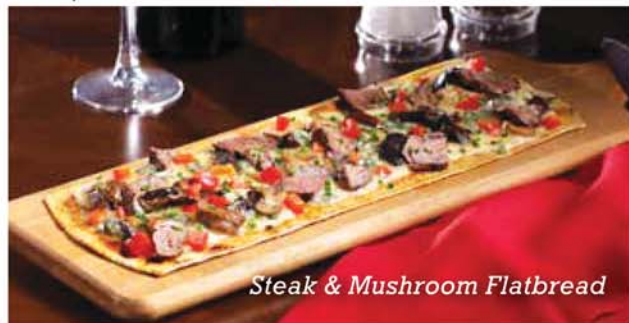
Steak & Mushroom Flatbread

Grilled beef, blended cheese, mushrooms, red peppers, green onions, and bistro sauce. $19